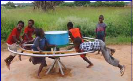
Chongwe School Kid-powered water tower!

Income generating projects that could support some school activities are not being carried out due to lack of seed funding. The entire community needs to be engaged more fully and trained to provide better care and support for OVC.