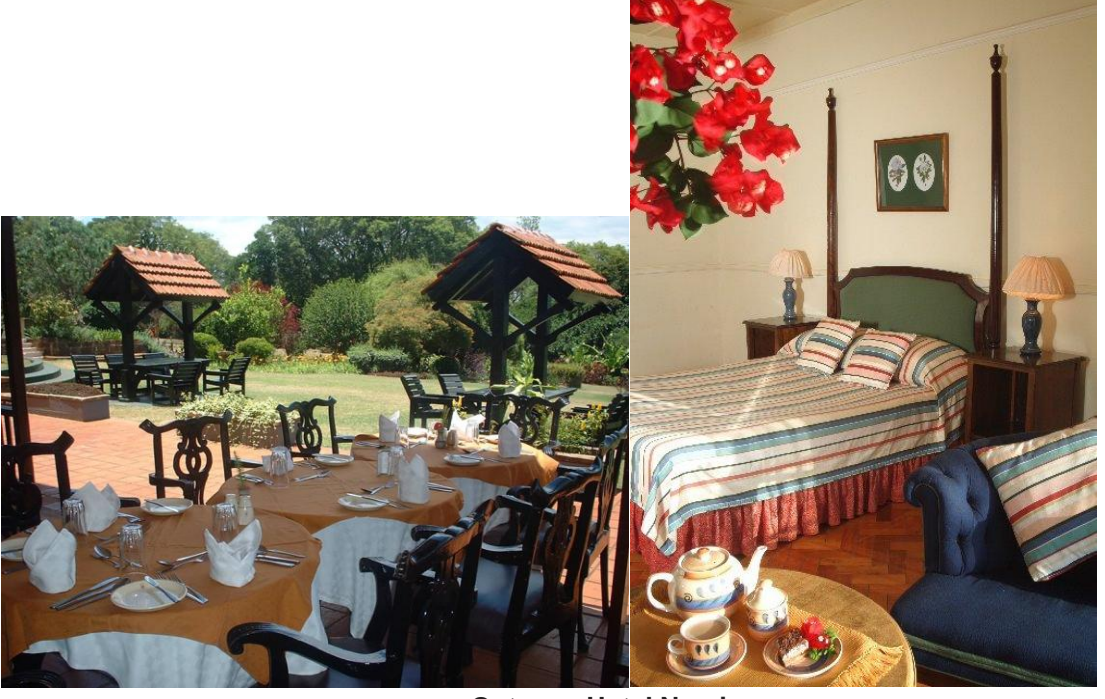
Outspan Hotel Nyeri