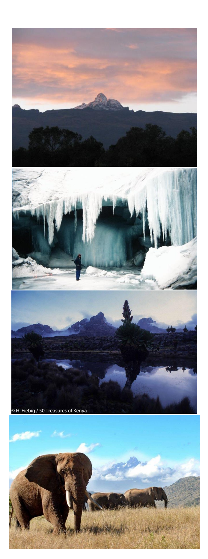
Mountain Bull on Mount Kenya R.I.P. Mountain Bull