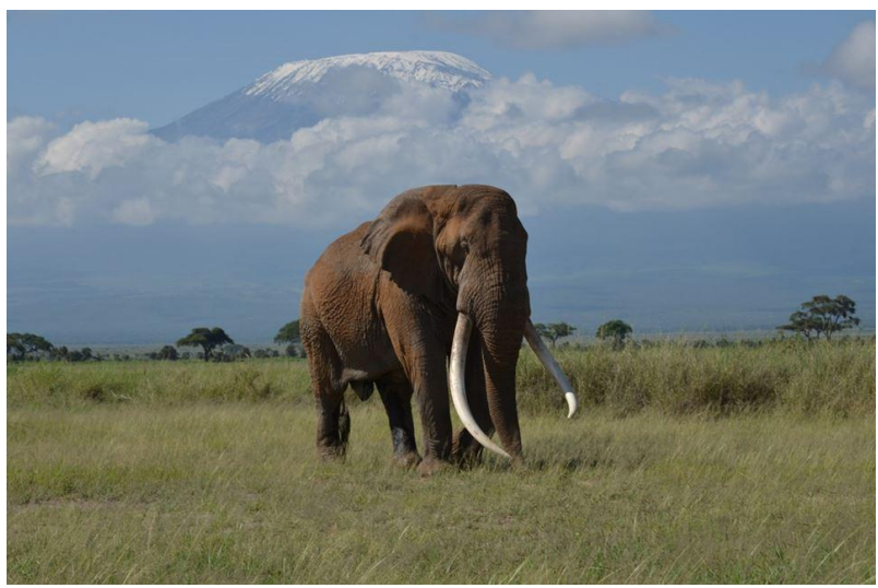
Big Tim in Amboseli

01 Night accommodation at Safari Park Hotel on bed & Breakfast basis 02 Night accommodation at Oltukai Lodge in the Amboseli National Park. Lunch at Eka Hotel Nairobi and day room at Eka Hotel Nairobi. Transportation in 1X 6 seater Customized Safari Mini-Van Departure transfer to Jomo Kenyatta International airport.