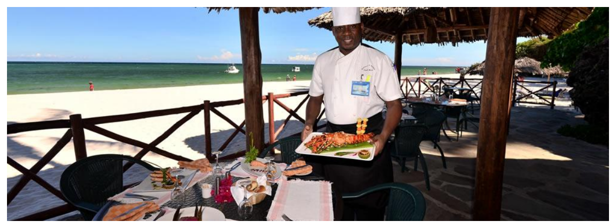
Diani Beach Mombasa